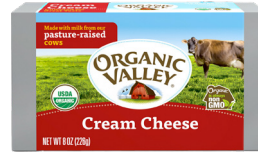
Organic Valley Organic Cream Cheese